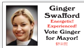
1230 2" x 3 1/2"

GillGreen Products Available! See page 7.